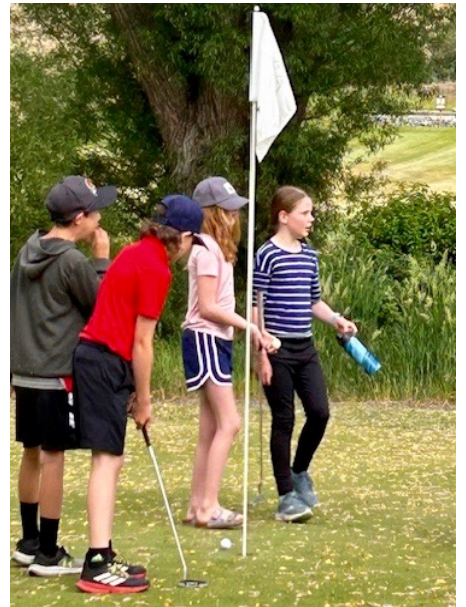
Young golfers learn about etiquette.